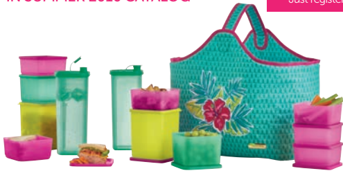
Tropical Glamour Picnic Set

CONGRATULATIONS! Register now for Jubilee @ exclusive rate. Just register one new Consultant to qualify. See reverse for details.