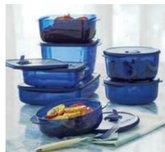
OR Vent 'N Serve® 7-Pc. Set